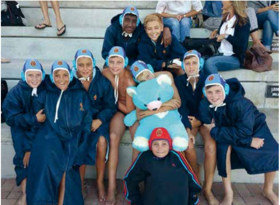
U13A Waterpolo runners up – Grey Tournament