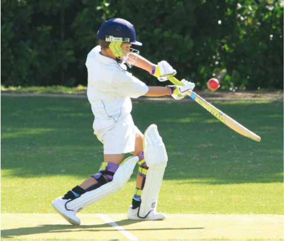
A classic straight drive

fielding. This helped us to only have to chase lower totals at a relatively moderate run rate per over. In the next two fixtures, where we had to bat first and post a total, we struggled to defend modest totals, even though we fought to the death. We realised that, with our bowling attack, just 20 extra runs on the board could have secured victory. These were very worthwhile lessons and we bounced back well to register three out of four wins in the remaining fixtures. The team has displayed amazing resilience and has definitely kept our loyal supporters entertained and on the edge of their seats with some superb performances. I would like to thank Vuyani Parafini for his passionate assistance throughout