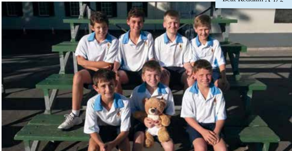
U13A Tennis Team in Port Elizabeth