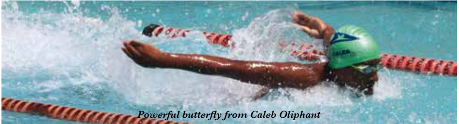
Powerful butterfly from Caleb Oliphant