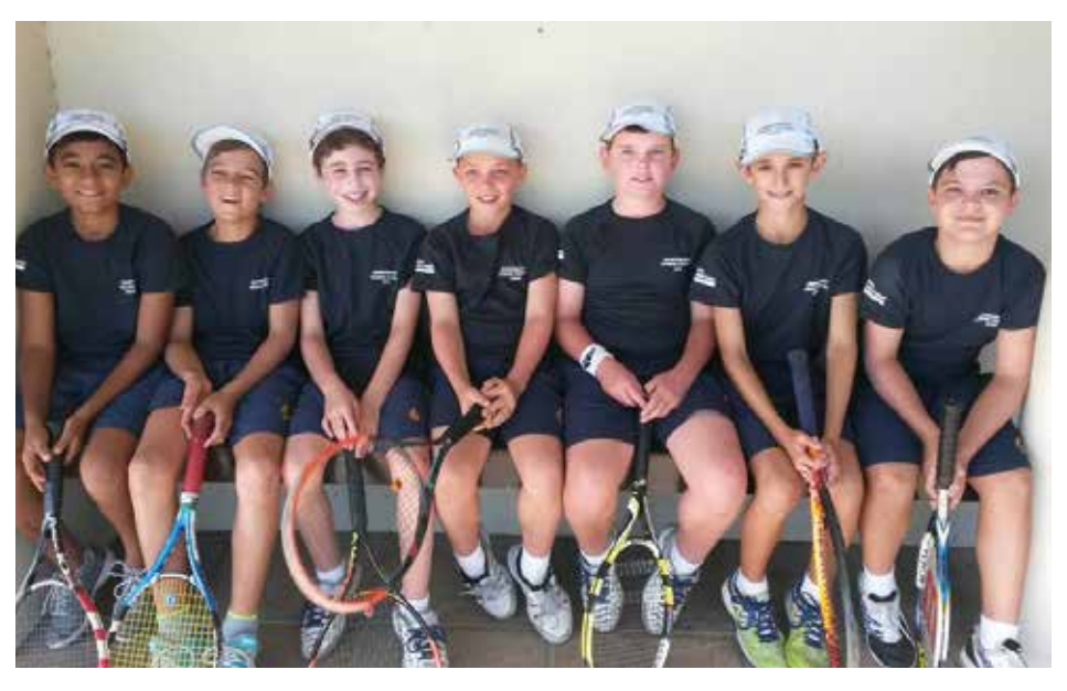
Enjoying the Rondebosch Tennis Festival