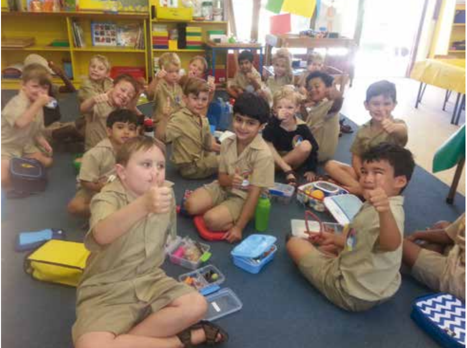
Happiness is ... being in Grade R