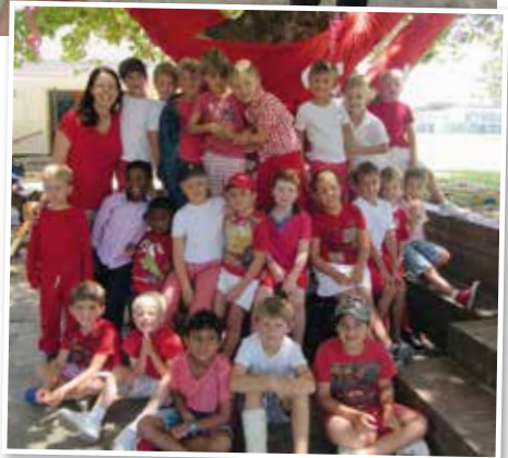
Valentine's Day Celebrations

Valentine's Day followed soon after our busy start to the new year. The Grade 2s decided to decorate a biscuit with delicious icing and special sprinkles. They each wrote their own card to a