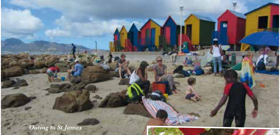
Outing to St James

Aquarium was a little different. The boys and their teachers travelled in the school bus to the Waterfront. Here they first had a formal lesson in one of the classrooms and then had time to explore. No matter how many times one visits the Aquarium, there are always new things to see and facts to learn.