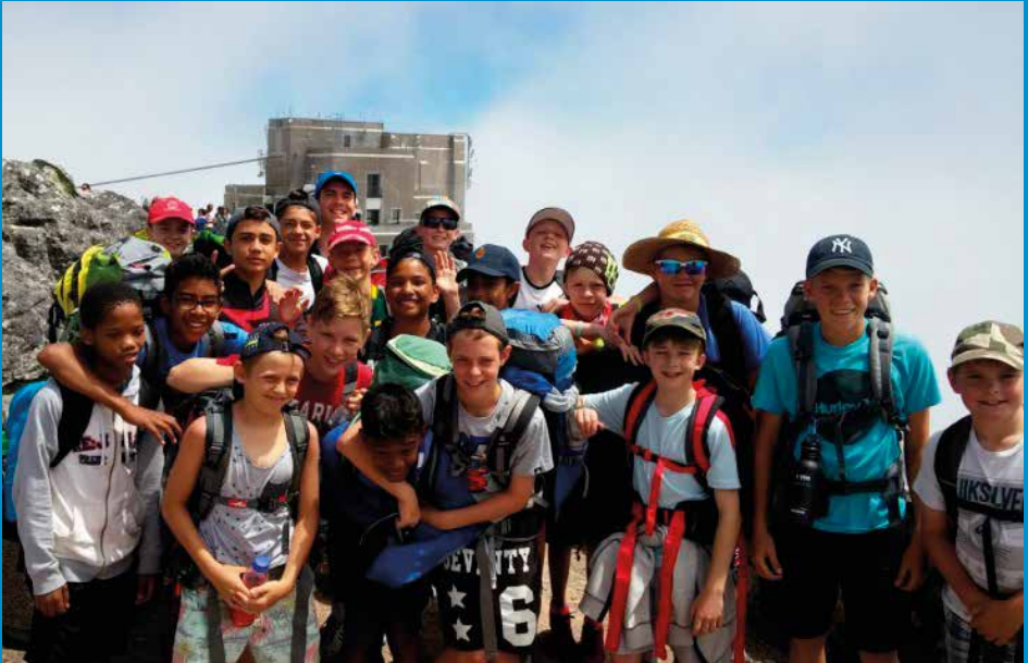
TABLE MOUNTAIN ASCENT