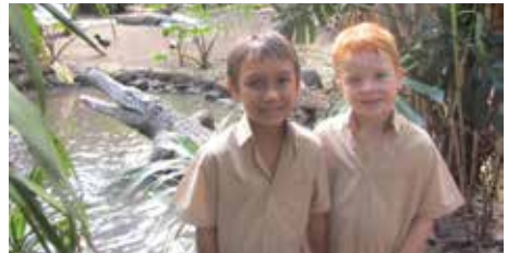
Grade 1 Outing