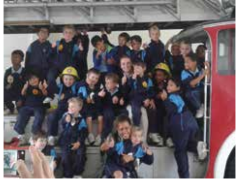
Fire Station Fun