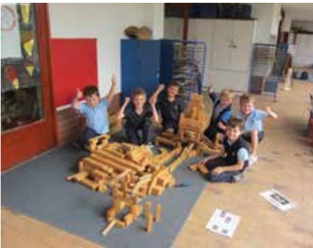
Fun with construction: Grade RN