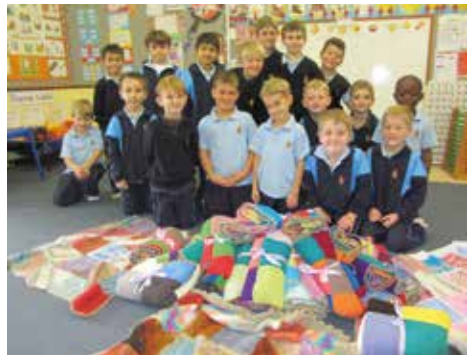
Blankets sewn and collected by Grade RC

Tour of the station, allowing boys to really experience an exciting and informative day in the life of a firefighter. The highlight of course, was the trip around the station yard in the Fire Engine. Every single boy had the ride of his LIFE with sirens blaring and boys on the loudspeakers calling out ‘EMERGENCY! EMERGENCY!’ We also explored the ‘vintage’ fire engine where the boys were allowed to have a bit of fantasy play, which they loved. A huge ‘thank you’ to all the parents who contributed towards treat hampers for the firemen. They really