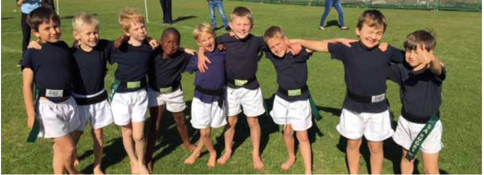
Grade 2LF at the Tag Tournament