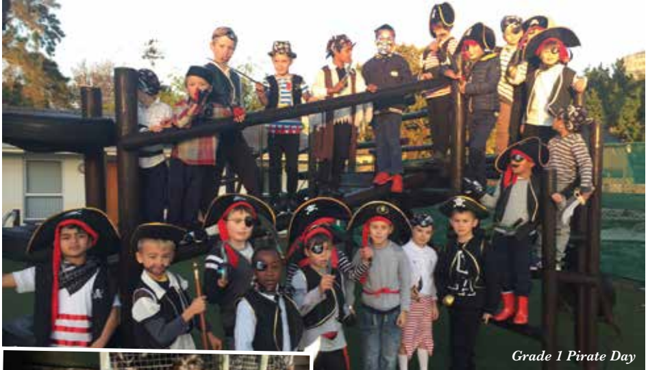
Grade 1 Pirate Day