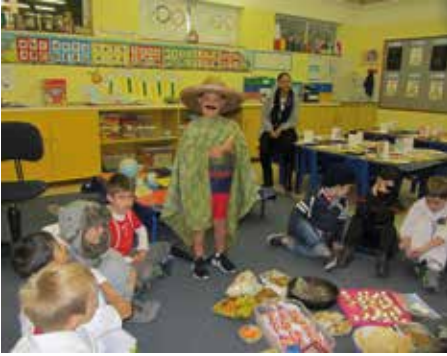
International Food Day was a blast