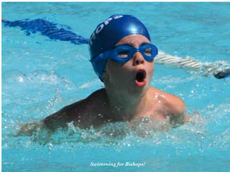
Swimming for Bishops!