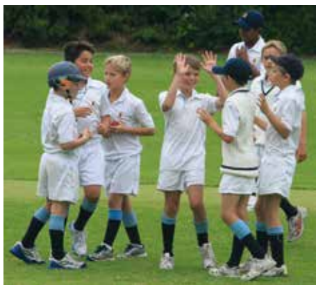
U10A celebrates a prized wicket