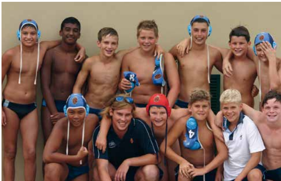
U13A Water Polo Team 2014