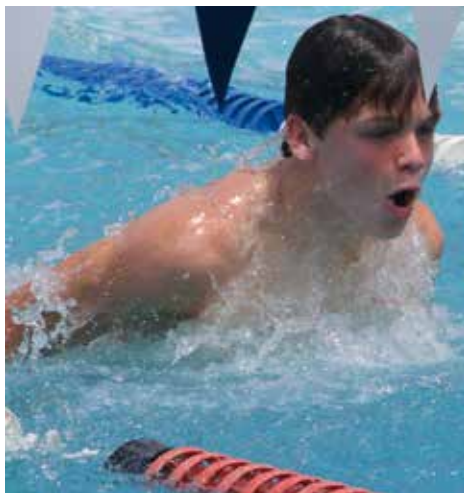
Sam Elliott performing well