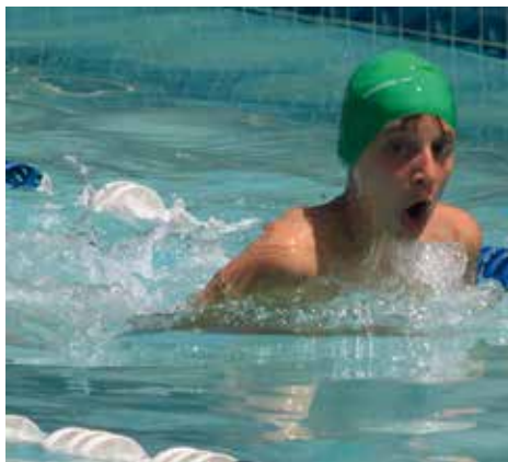
Go Brooke House!

team, Prep swimming would not be such a success. Well done to the swimmers – keep striving to do your best, dream big and reach your goals!