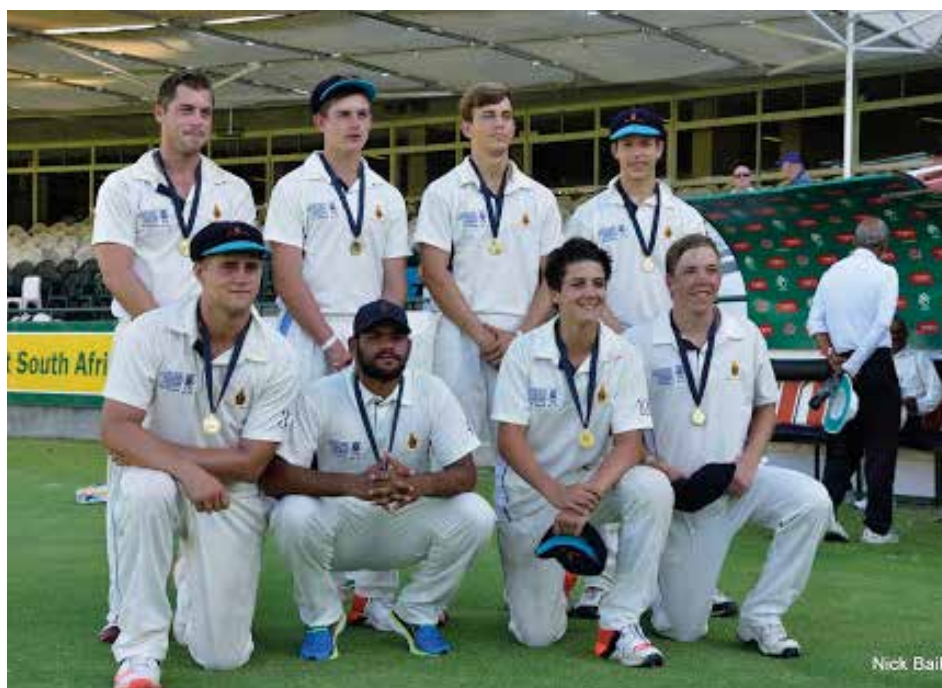
Wynberg six-a-side victors