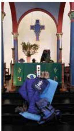
Blessing of the Boots

Amid the summer heat, the New Year at school has had a blistering start with extremely hot days and blustery south easter winds. The country is in the grip of a drought and water restrictions are starting to bite. December presented some incredible and beautiful days of summer and the long summer evenings were perfect for the holiday break. It was good to meet with many ODs and their families as they visited the campus and enjoyed the beautiful grounds and chapels of Bishops. Looking back – there was a rush of end-of-year functions, including the Remembrance Day service with Dr Rodney Warwick presenting; the Epic Blessing of the Boots service; the Advent and Christmas Carol services; Prep Prize Giving; the newly revamped Pre-Prep Carol service and Nativity play; Richard Cock's Christmas Carols service