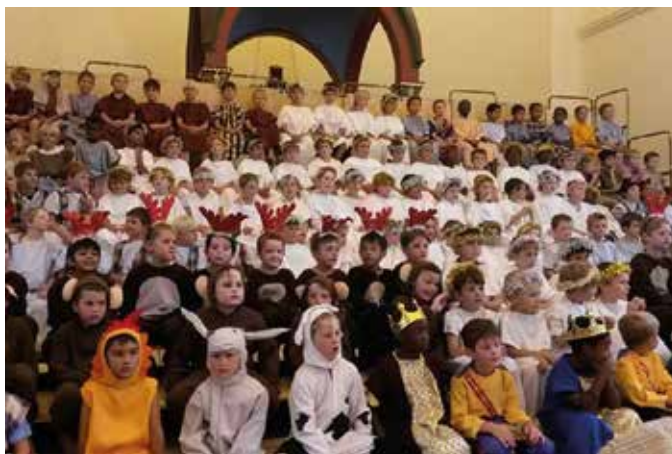
Pre-Prep Carol Service

Amid the summer heat, the New Year at school has had a blistering start with extremely hot days and blustery south easter winds. The country is in the grip of a drought and water restrictions are starting to bite. December presented some incredible and beautiful days of summer and the long summer evenings were perfect for the holiday break. It was good to meet with many ODs and their families as they visited the campus and enjoyed the beautiful grounds and chapels of Bishops. Looking back – there was a rush of end-of-year functions, including the Remembrance Day service with Dr Rodney Warwick presenting; the Epic Blessing of the Boots service; the Advent and Christmas Carol services; Prep Prize Giving; the newly revamped Pre-Prep Carol service and Nativity play; Richard Cock's Christmas Carols service