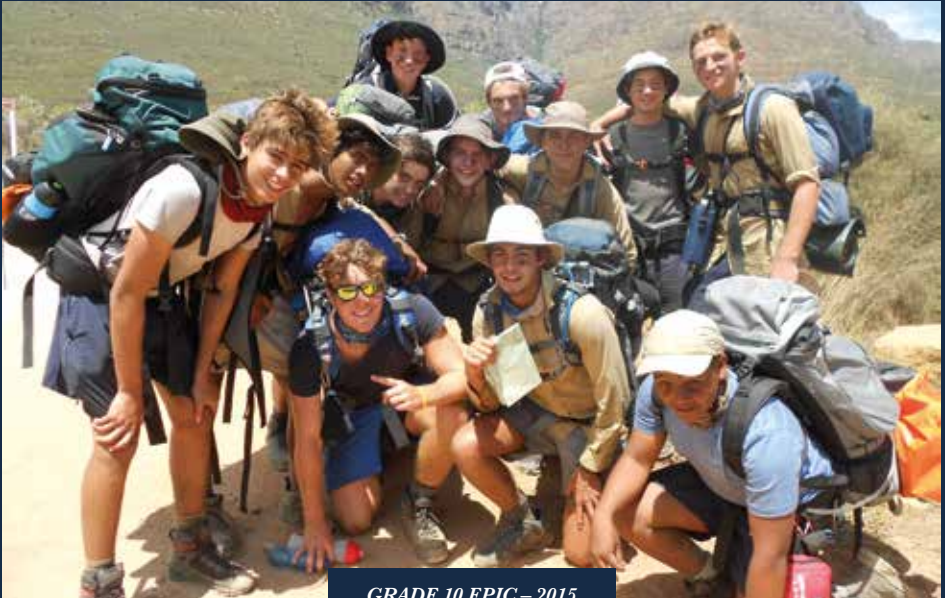
GRADE 10 EPIC – 2015